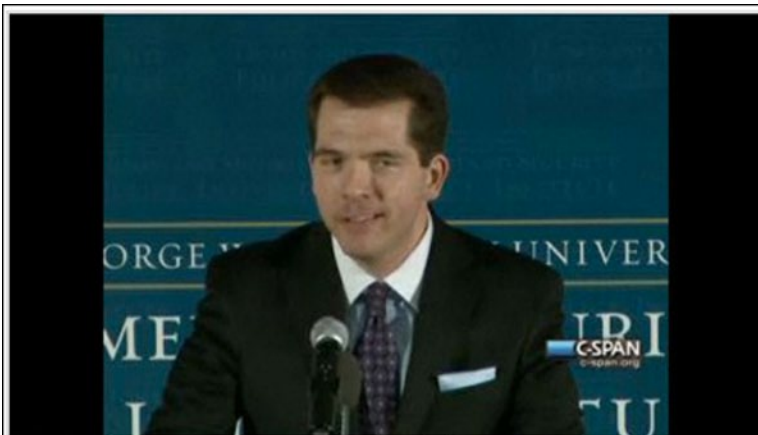
Brian Kamoie, the senior director for preparedness policy on the White House's national security staff, outlined the purpose of the directive during a Friday (8 April 2011) forum hosted by The George Washington University's Homeland Security Policy Institute.

Implementing a multi-discipline, multi-jurisdictional approach to national preparedness will help the United States reach its overarching national preparedness goal. PPD-8 addresses the fact that a one-size-fits-all approach to preparedness in a nation where each community has different needs based on different risks does not work. By pooling efforts, defining capabilities, and focusing on outcomes, the nation will be better prepared for any hazard. Kamoie sums up the objective of the National Preparedness Directive: “We aim to prevent what we can and respond rapidly to what we must.”